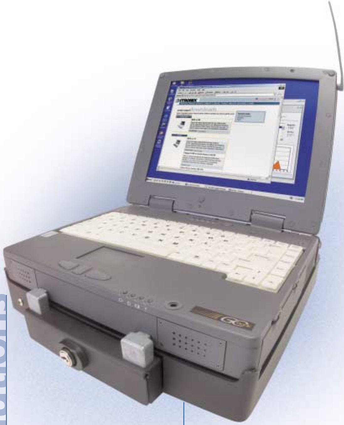
GoBook MAX ® vehicle cradle

A firm lock on in-vehicle computing for mobile workers