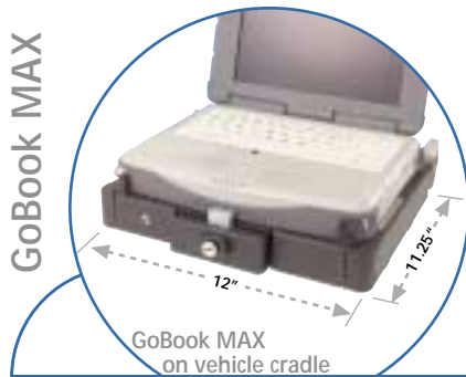
GoBook MAX on vehicle cradle

Maximize the effectiveness of your mobile computing investment with Itronix computer vehicle cradles.