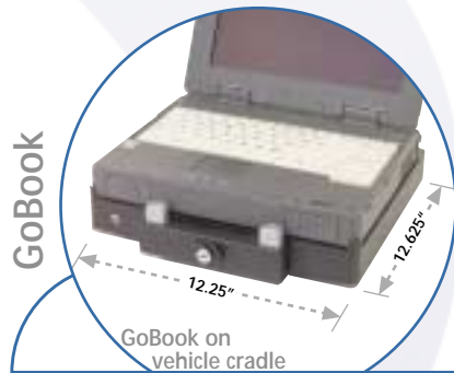
GoBook on vehicle cradle