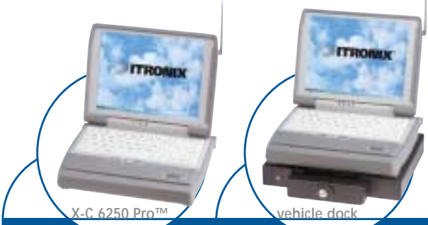
X-C 6250 Pro™