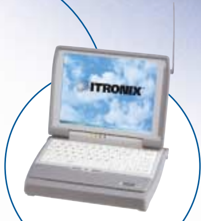
X-C 6250 Pro™

wireless mobile computing Solutions for your enterprise